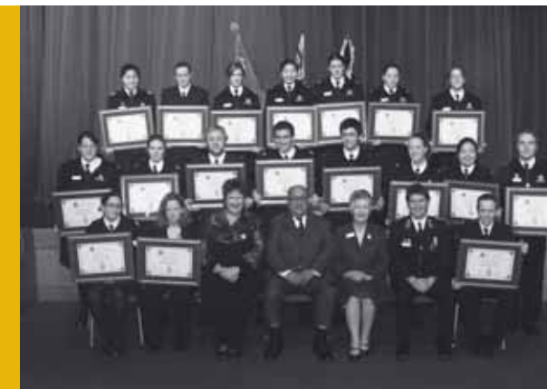
Northern Region (SI) Grand Prior's Award recipients pictured with His Excellency The Hon Anand Satyanand and Her Excellency Mrs Susan Satyanand.