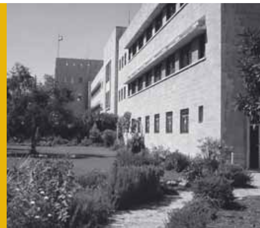
The St John of Jerusalem Eye Hospital.