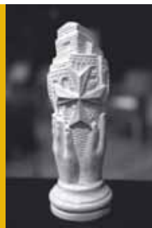
To mark the 125th anniversary of the St John of Jerusalem Eye Hospital a special Icon was created, carved from Jerusalem stone.