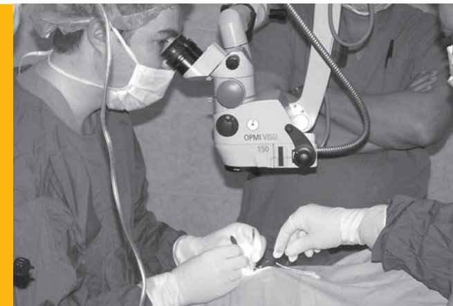
Over 3,000 cataract surgeries are performed at the St John Eye Hospital in Jerusalem every year