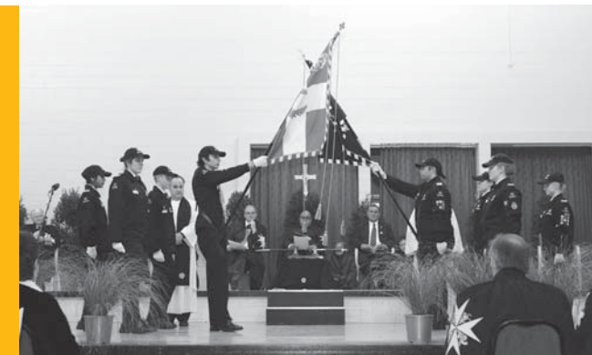
The Investiture Service held at Turangawaewae Marae in July was the second time a Service has been held there, the first was in 1986