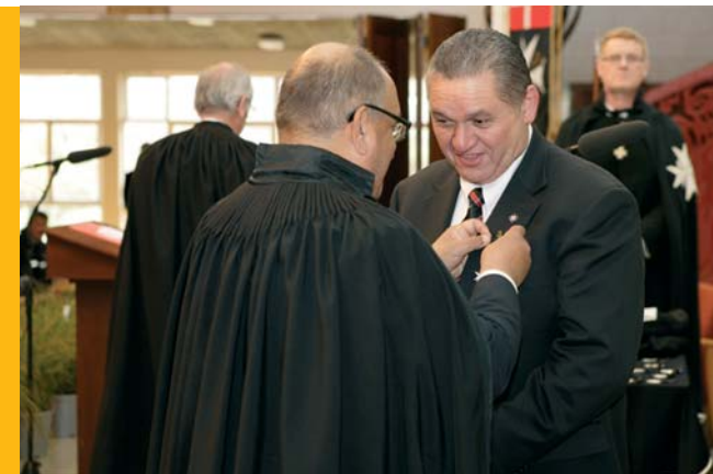
His Excellency The Hon Anand Satyanand invests Te Arikini Tuheitia as an Officer of the Order of St John at our investiture at Turangawaewae Marae