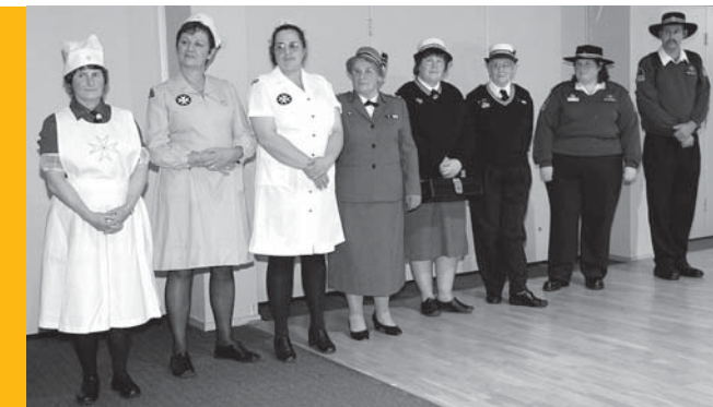
A parade of St John uniforms at the Centennial Celebrations of the Selwyn Guide Division in Christchurch