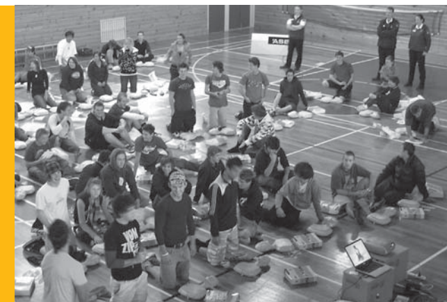
Students at Nelson's Nayland College were some of the 1000 people who learnt CPR for free on the same day in June 2008 thanks to ASB and St John.